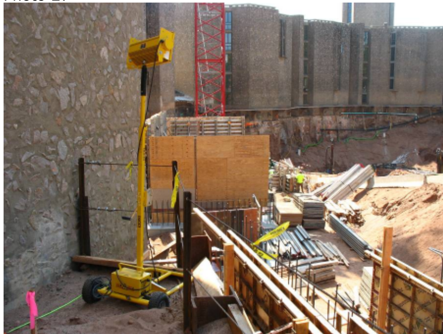
Existing Building/Addition – View of jet grouting/underpinning for footing support and excavation support