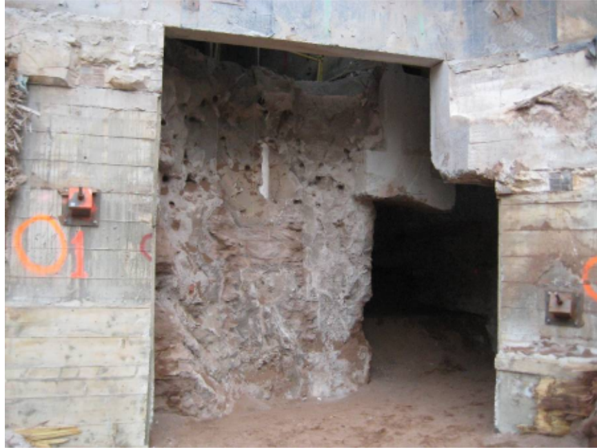
Existing Building – View of jet grouting and underpinning extending under existing building