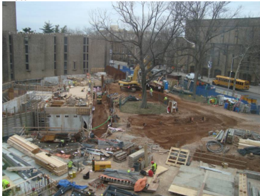
Addition – View of addition being built from the existing building