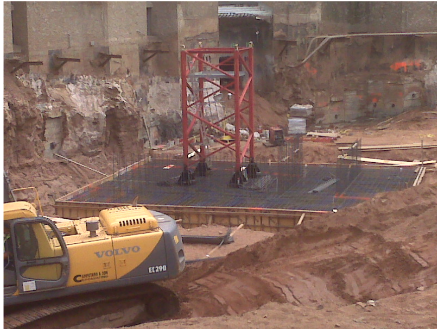
Addition – View of tower crane mat footing with integrated building footing